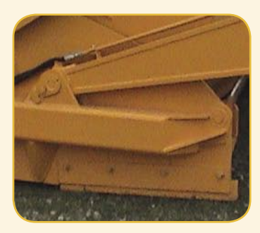
Replaceable slobber bits.

Four independently mounted, off-set tires allow the Carry-All to work at a high speed while remaining stable throughout the moving, loading and unloading of soil.